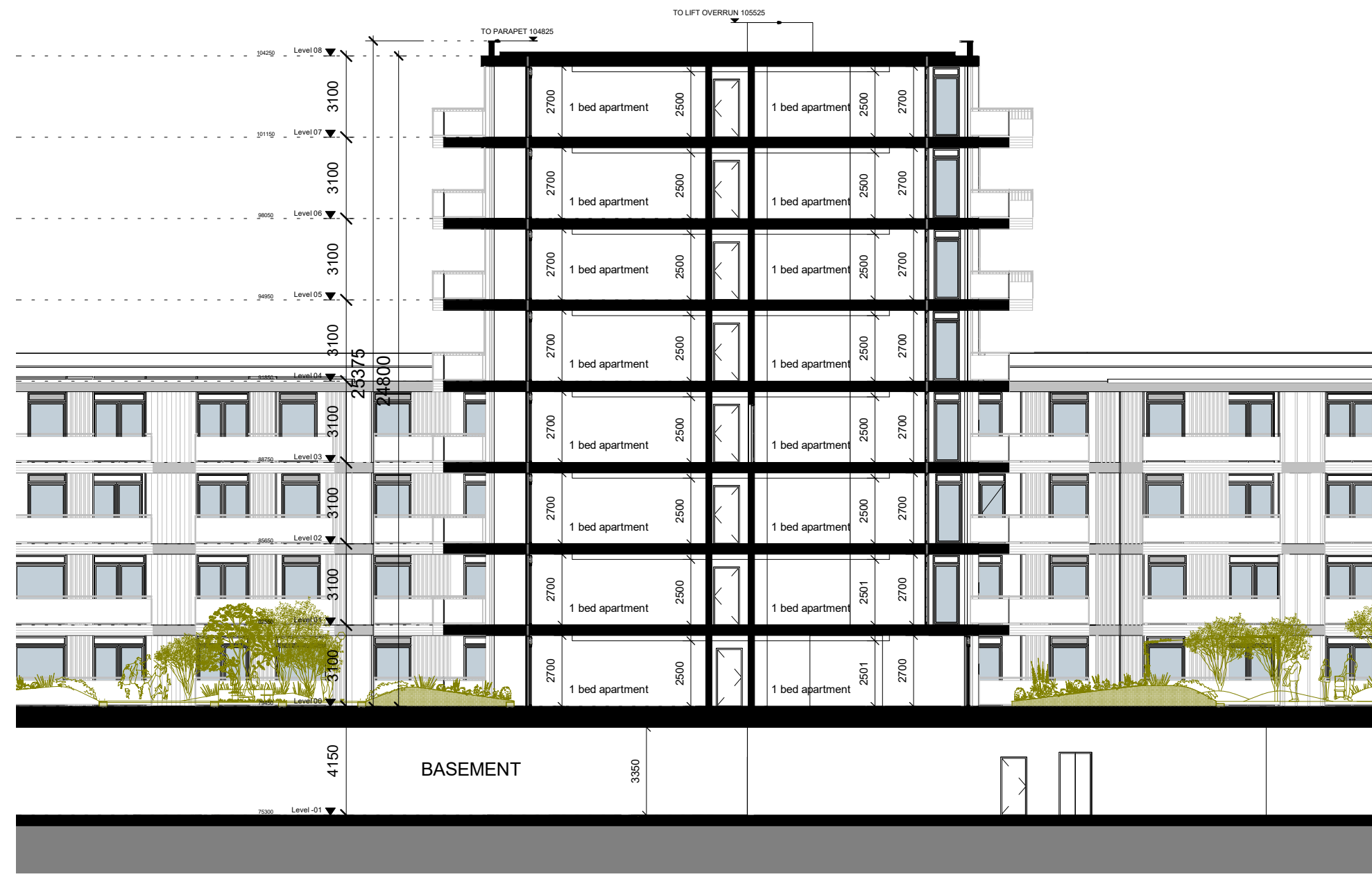
6 Block A2 Proposed Section 02 1 : 200