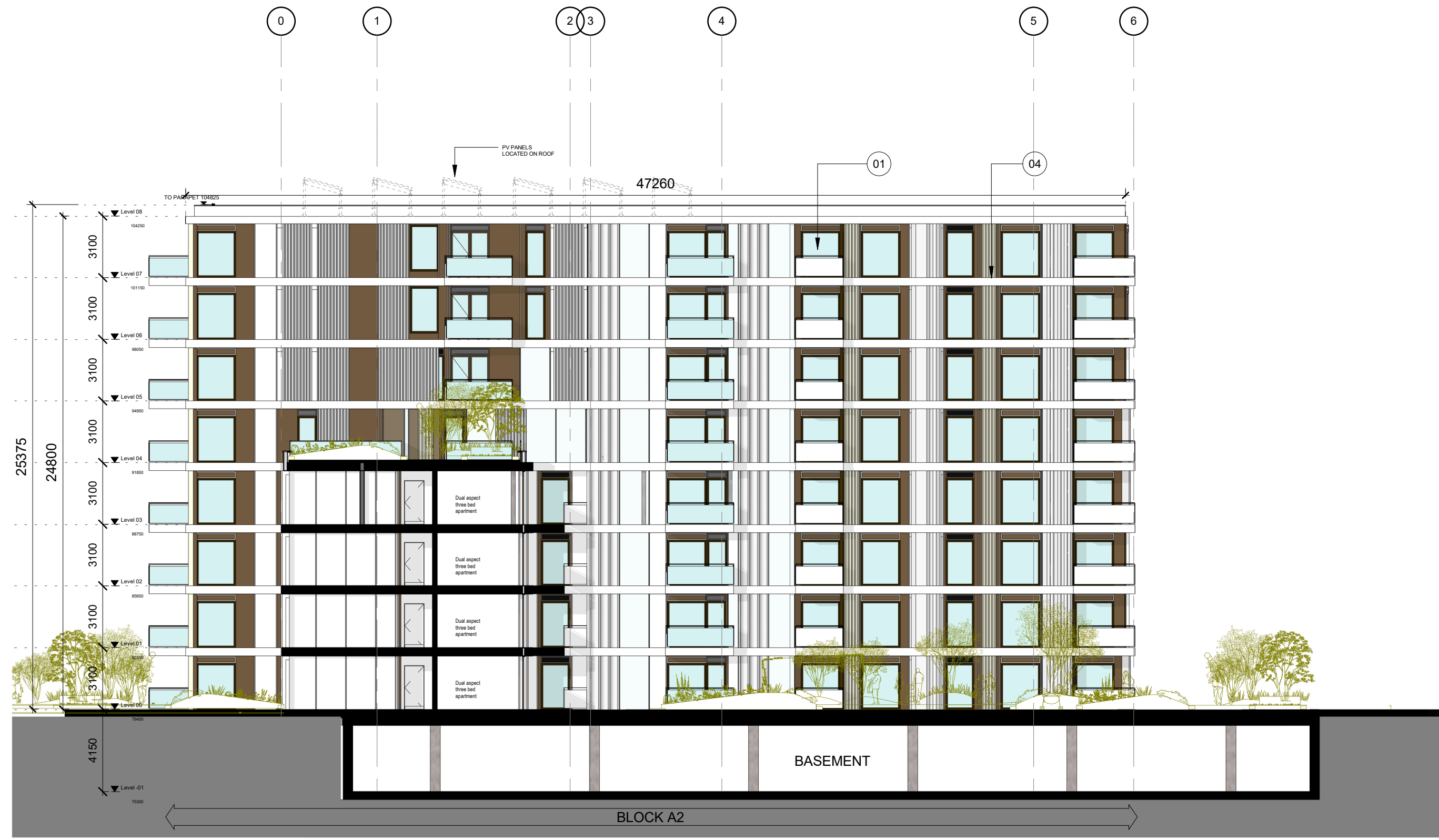
1 Block A2 Proposed Elevation 01 1 : 200