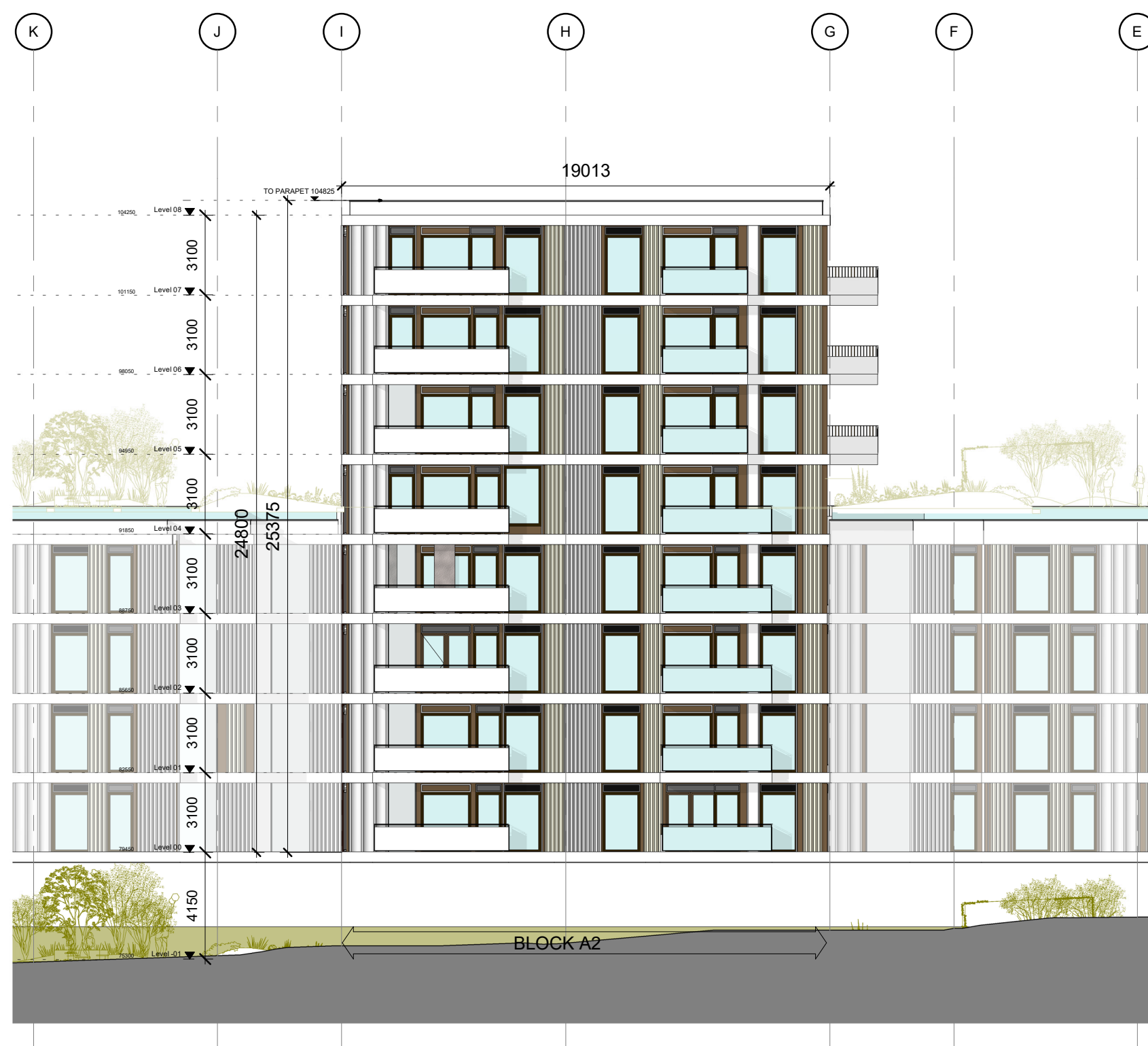
4 Block A2 Proposed Elevation 04 1 : 200