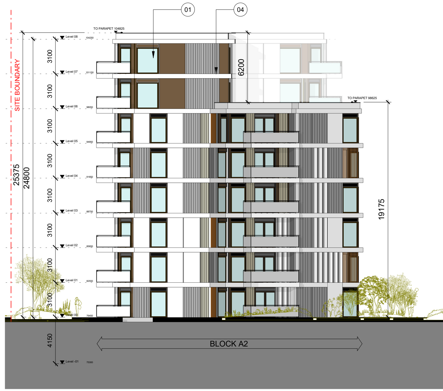
2 Block A2 Proposed Elevation 02 1 : 200